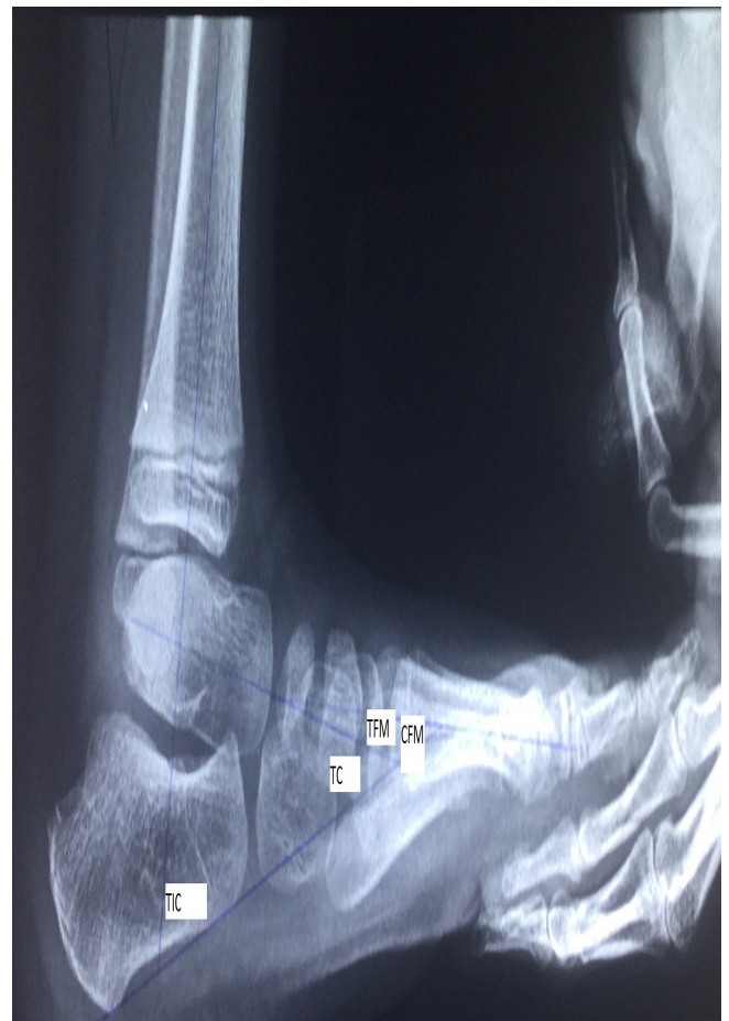
Figure 2. The measured angles in foot and ankle lateral view.