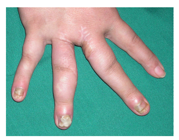
Figure 1. Nail dystrophy, onycholysis and onychorrhexis of middle, ring and little fingernails in the right hand four months after reconstruction of third web for syndactyly.

inflammatory cells and some vasodilatations. The clinical and histopathology findings were compatible with diagnosis of isolated nail psoriasis. Histopathologic sections show nail and skin tissue with psoriasis form accanthosis, heperkeratosis, elongated rete ridges, focal epidermal spongiosis, focal subepidermal vesicle formation, perivascular lymphocytc infiltration and fibrosis [Figures 2; 3].