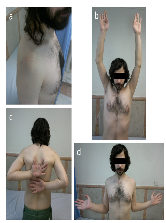
Figure 2. Near full ROM of the shoulder, 2 years postoperatively in the same case that was presented in Figure 1 and 2; a) scar of surgical incision, b) forward flexion, c) internal rotation and, d) external rotation.

surgery, and missed in 2 of them afterwards [Figure 3]. No intra-operative complications were recorded. There was no any neurovascular injuries, infection, heterotopic calcification, avascular necrosis of the head, or skin problems. Radiographic studies revealed complete union in 7 fractures at 3 months and in all fractures at 6 months