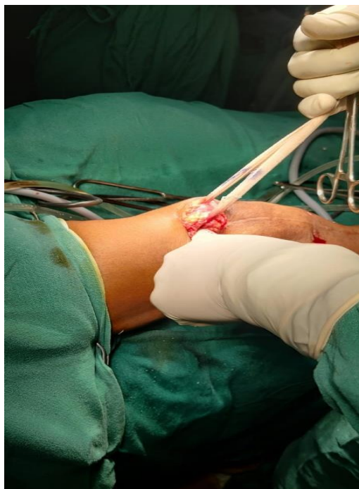
Figure 4. Erasing quadriceps muscle from the underlying femur.