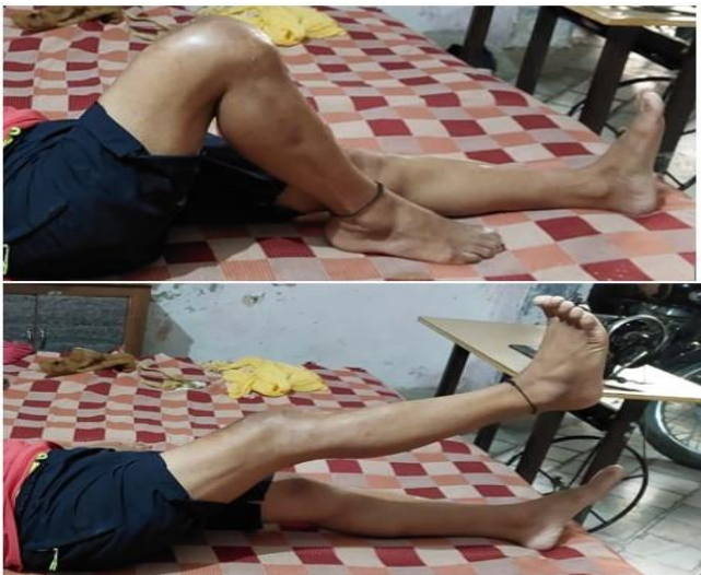
Figure 7. Clinical picture of the follow-up of the patient depicting knee flexion and extension.

Weekly follow-ups were done to assess the range of knee motion and the wound condition. In the case of wound dehiscence, wound suturing was performed under aseptic conditions. After 2 weeks, monthly follow-ups were done, and the range of motion and knee functional scores were assessed for at least 12 months [Figure 7]. None of the patients were lost to follow-up.