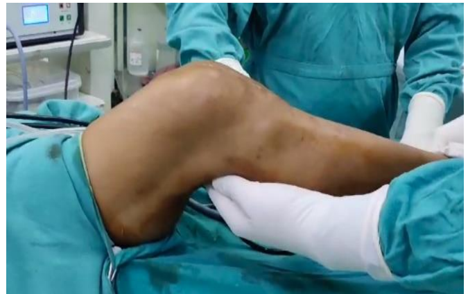
Figure 1. Clinical picture of the maximum knee flexion preoperatively.

Afterwards, a 4-6 cm suprapatellar midline incision was given extending from the superior pole of the patella. The subcutaneous dissection was done to remove any adhesions. The quadriceps muscle was dissected from the lateral and medial tissue adhesions using sharp scissors.