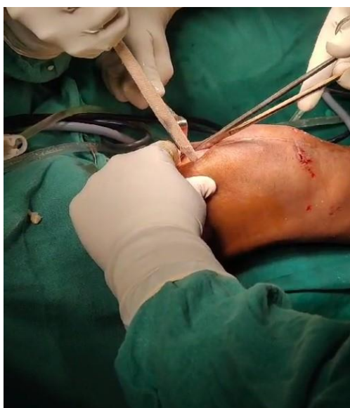
Figure 5. Dissection of the medial and lateral aspects of the knee