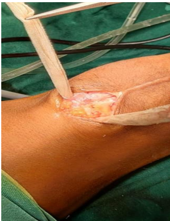
Figure 3. Isolation of the rectus femoris muscle from the adjacent adhesions.

with the hip flexed at 90 degrees. Caution was taken not to rupture the rectus femoris and patellar tendon or any other ligament. This was confirmed with the help of dry arthroscopy at the end of the procedure. The wound closure comprised of skin sutures with the knee in full flexion, 20 ml of 0.75% ropivacaine infiltration and dressing with the knee in flexion.