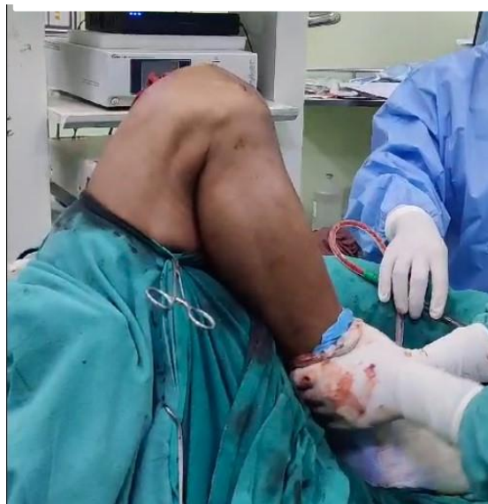
Figure 6. Clinical picture of the near-full range of knee motion in operation theatre