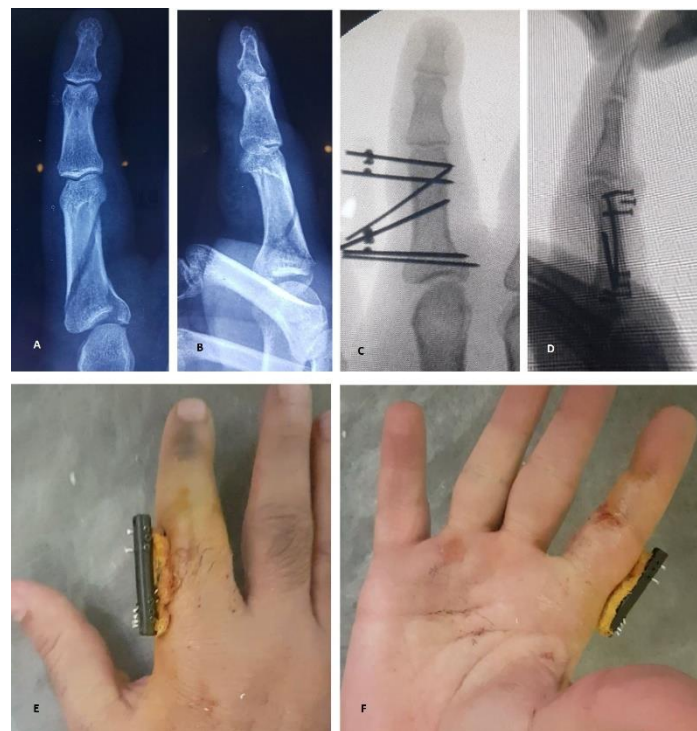
Figure 1. A and B: Anteroposterior and lateral radiographs of a proximal phalanx fracture with articular depression. C and D: Intra-operative anteroposterior and lateral fluoroscopy after the application of uni-planar mini external fixator. E: Third-week visit

fracture. We placed the rod at a distance of 5-7 mm from the surface of the skin. Following that, the pins were fixed to the rod using 1.4-mm metal screws. Finally, the pins which were fixed to the rod with screws were cut tangentially to the fixator. The pins which were not fixed to the rod with screws were cut a little longer, and the end of the pin was bent over the rod. In case of severe comminution and instability of middle phalanges, the bi-planar external fixator can be used. When the fixator was applied, the pins were wrapped with Vaseline gauze soaked in betadine, and finger movements were initiated in the operating room [Figure 1].