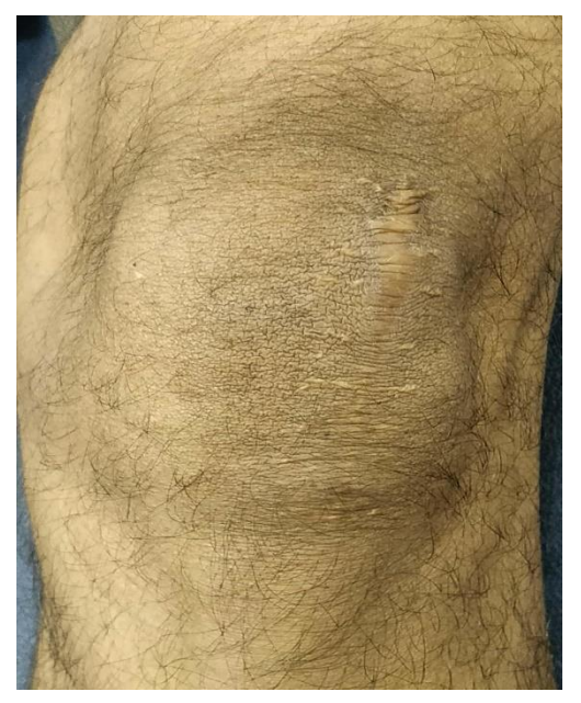
Figure 8. Clinical picture of complete wound healing (scar) and no discharging sinus

After the spine and hip joints, the knee is the third most common joint affected by osteoarticular tuberculosis. However, isolated tubercular patellar involvement is very uncommon, with an incidence of 0.09 to 0.15%.3-8 Aitken reported two cases of patellar TB (one paediatric male patient) in 1933.11 Differential diagnosis of such lytic chondroblastoma, osteoblastoma, lesions includes infected aneurysmal bone cysts, metastatic lesions, Brown tumours, gout, pyogenic and fungal osteomyelitis, etc.<sup>5,7,8</sup> The likely triggers for the infected tuberculous osteomyelitis are trauma, which would activate the infection focus, poverty, immunocompromised status like AIDS. The resistant strains of AFB Bacilli are seen in patients from high prevalence areas like India and other Asian countries.<sup>1,8</sup> Osteoarticular involvement is probably of hematogenic or pulmonary origin.9 Tuli SM et al. examined over one thousand cases of Tuberculosis of bones out of which 90 (8.3%) involved the knee, out of which only one (0.09%) was localised in the patella.<sup>2,3,8,9</sup> Although radionuclide bone scans, CT, and MRI scans have been reported in the literature as excellent diagnostic aids for diagnosing such lesions, biopsy remains the