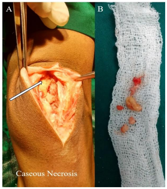
Figure 4. Intra-op Images showing (A) caseous yellow bone necrosis and (B) a biopsy sample for histo-pathology

only normalised ESR and CRP levels but also improved knee asymptomatic and without any signs of local recurrence [Figure 7, 8].