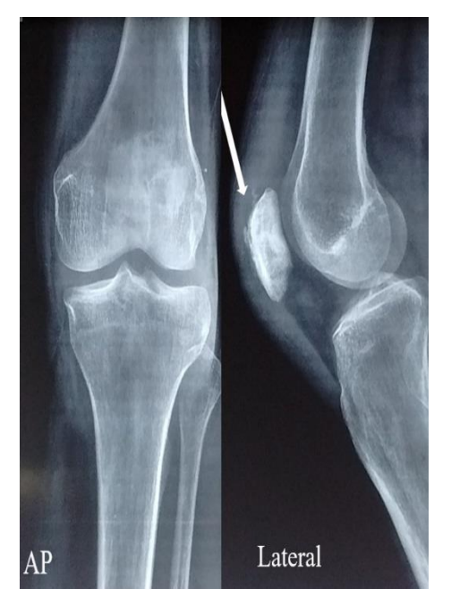
Figure 1. X-ray AP and Lateral views showing lytic lesion (Arrow) with erosion and periosteal reaction

localised rise in temperature as compared to another knee. over the patellar tendon [Figure 2]. No intraarticular extension was seen except for some reactionary joint effusion. There was an enlarged popliteal lymph node. Blood work was suggestive of anaemia, with an elevated ESR at 55 and elevated qualitative CRP. X-ray chest evaluation showed an old 5th rib fracture with pleural effusion obscuring the left costophrenic angle [Figure 3]. According to the abovementioned findings, infective bacterial post-traumatic osteomyelitis with prepatellar bursitis was the provisional diagnosis, and workup was done for surgery of excision biopsy, debridement, and placement of biodegradable calcium granules mixed with antibiotics.