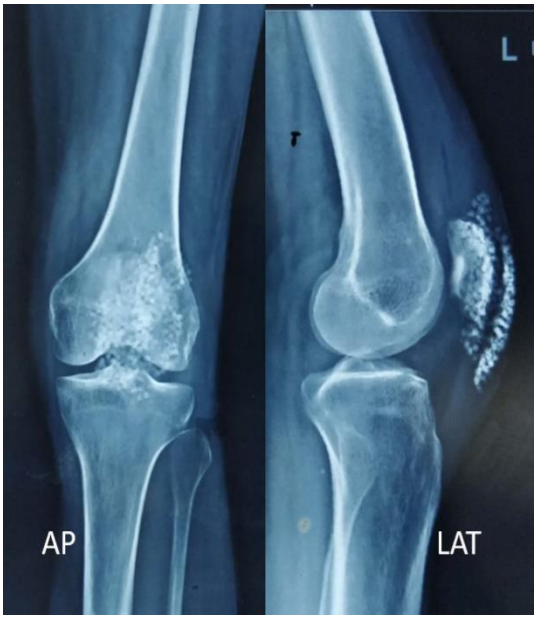
Figure 5. Post of Knee x-ray AP and Lateral views showing bioabsorbable calcium beads Impregnated with antibiotics