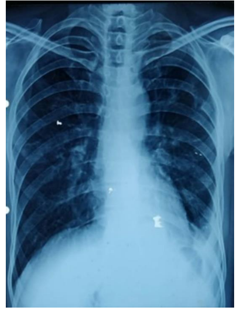
Figure 3. Chest X-ray PA view suggestive of rib fracture and left-side pleural effusion obliterating costophrenic angle

As a first step in surgery, aspiration of the knee was done, and the synovial fluid was sent for culture and sensitivity with fluid analysis. Intraoperatively, author found that the osteomyelitis showed friable necrotic tissue with caseous necrosis of bone, as shown on the clinical picture [Figure 4]. All of the pathological tissue, along with the prepatellar bursa, was resected and curetted and sent for histopathology, acid-fast bacillus culture, and sensitivity, along with gram culture [Figure 4].