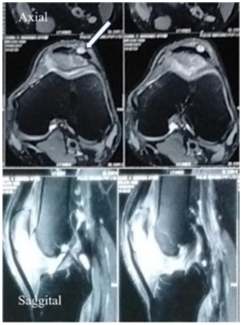
Figure 2. MRI images (A) Axial Section; (B) Sagittal Section