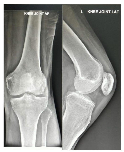
Figure 7. Follow-up x-ray knee AP and Lateral views after 6 year shows complete bone healing