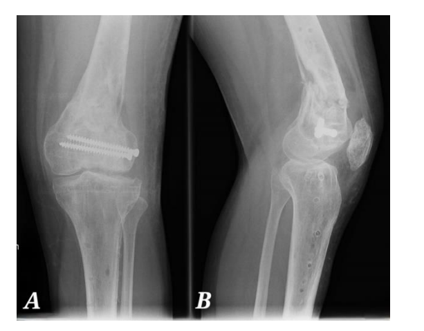
Figure 2. A: AP radiography shows severe osteoarthritis in the lateral compartment. B: LAT radiography shows a non-union femoral supracondylar region with osteoarthritis changes in the patellofemoral joint

Figure 1. Photography of the patient before surgery A: knee joint in extension B: knee joint in flexion C: Limbs alignment in standing