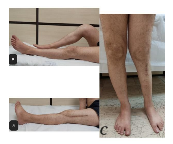
Figure 1. Photography of the patient before surgery A: knee joint in extension B: knee joint in flexion C: Limbs alignment in standing

Before the operation, 1 g of intravenous tranexamic acid was administered. Without the control of a tourniquet, a midline longitudinal incision was made on the skin, with a standard medial parapatellar approach used for the knee arthrotomy. A total synovectomy was performed. Reaming the femoral canal was done. Five samples from the femoral canal and synovium were sent for culture. We needed to release the quadriceps muscle from the anterior cortex of the femur and perform lateral collateral ligament needling to achieve a standard extension/flexion gap.