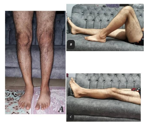
Figure 5. Photography 2 years after surgery A: standing view B: knee flexion C: knee extension

Figure 4. Post Operative radiography shows NexGen legacy Constrained Condylar Knee (LCCK) system with femoral and tibial stem and PS polyethylene A: Anter-posterior view B: Lateral view