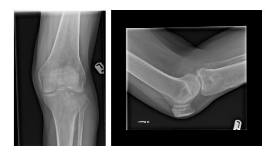
Fig 4. Radiographs on the day of the injury for Patient 4

CONSERVATIVE MANAGEMENT OF VARUS/VALGUS STABLE TIBIAL PLATEAU FRACTURES