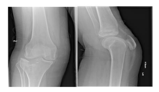
Fig 5. Radiographs on the day of the injury for Patient 5