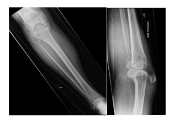
Fig 3. Radiographs on the day of the injury for Patient 3

CONSERVATIVE MANAGEMENT OF VARUS/VALGUS STABLE TIBIAL PLATEAU FRACTURES