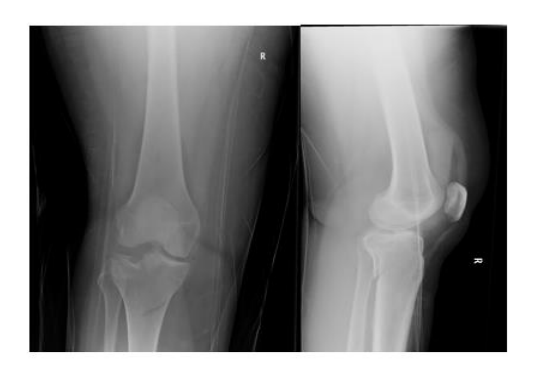
Fig 6. Radiographs on the day of the injury for Patient 6