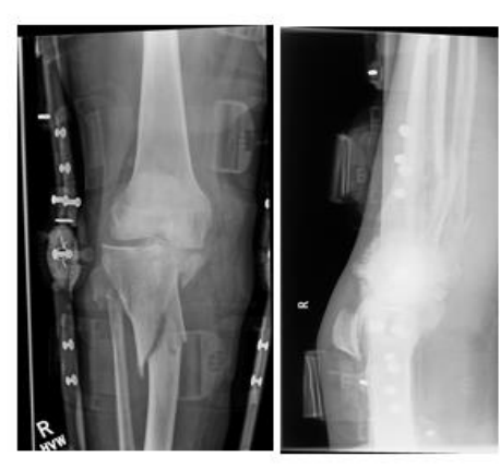
Fig 1. Radiographs on the day of the injury for Patient 1