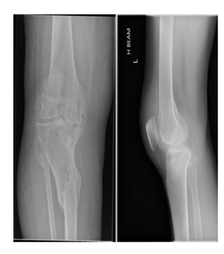
Fig 2. Radiographs on the day of the injury for Patient 2