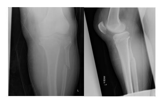
Fig 9. Radiographs on the day of the injury for Patient 9