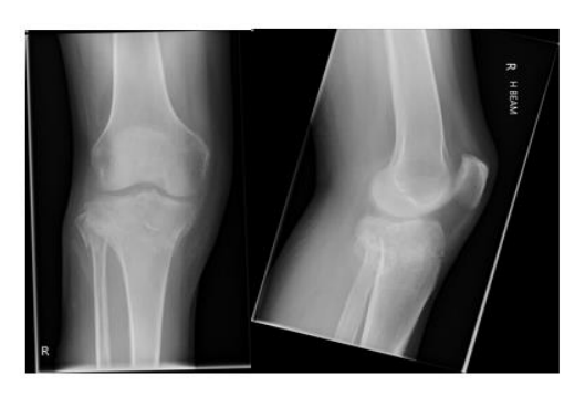
Fig 8. Radiographs on the day of the injury for Patient 8

Fig 7. Radiographs on the day of the injury for Patient 7