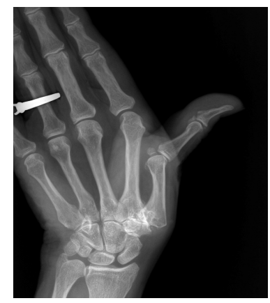
Figure 1. Radiograph of the collapse of the first ray in severe first carpometacarpal osteoarthritis.