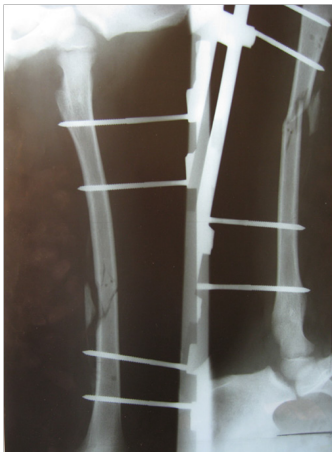
Figure 3. Fixation with external fixator in an open femoral fracture.

children (younger than 12 years) suffering from Gustilo grade A and B III open femoral fractures were admitted to the emergency department of the center and evaluated.