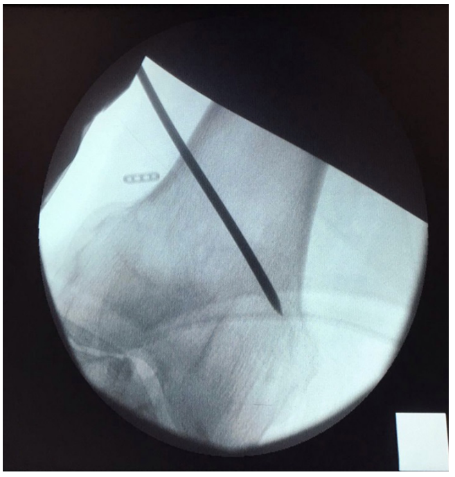
Figure 5. A 2.5 mm K-wire was inserted just proximal to the button, along the plan of the osteotomy, aiming at the adductor tubercle and under fluoroscopic guidance.

blade was used to perform a close-wedge osteotomy from lateral to medial direction while the quadriceps tendon and posterior neurovascular structures were protected. A bony wedge was removed from the lateral cortex without breaking the medial cortex .The wedge thickness was considered in millimeters equal to half the angle desired for correction in degrees.