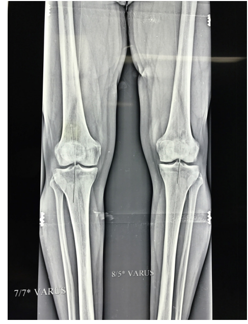
Figure 1. Preoperative standing full leg AP radiograph reveals bilateral varus knees in middle-aged man with ACL tear in the left side.

DISTAL FEMORAL OSTEOTOMY AND ACL RECONSTRUCTION