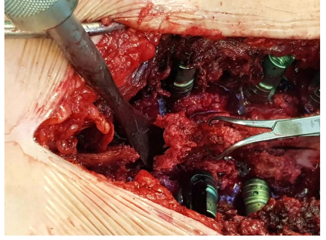
Figure 3. Pulling up of the spinous process by a towel clip and concurrent use of a Cobbs elevator to lever the lamina.

end of the decompression of corresponding levels (T2) were recorded. To measure the volume of the harvested autograft during the laminectomy, the resected bones