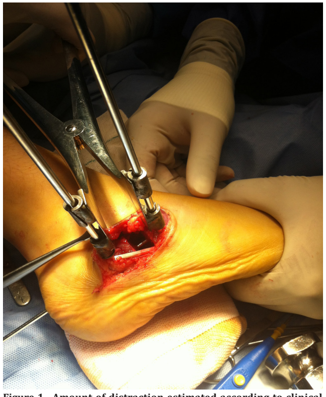
Figure 1. Amount of distraction estimated according to clinical correction. A longitudinal k-wire used before distraction.

Standard anteroposterior (AP), true lateral, and long axial view radiographs were taken pre and post