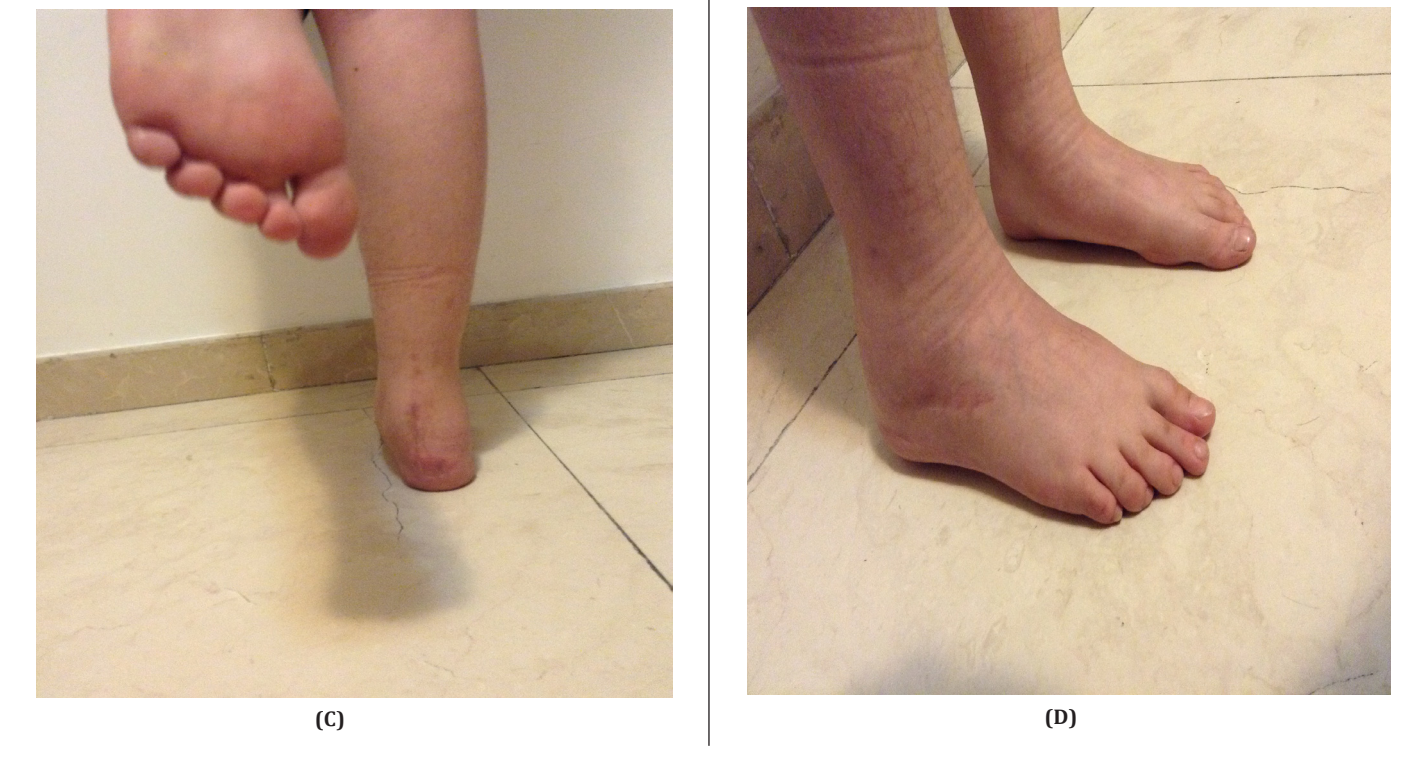
Figure 2. A 10 year-old-boy with idiopathic flexible flat foot before (A,B) and two years after (C,D) calcaneal lengthening osteotomy.