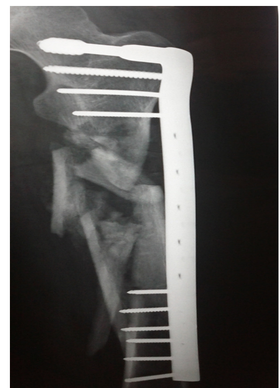
Figure 3. One month post-surgery, partial union.

Open reduction and internal fixation (ORIF) was used in cases of plateau, metaphysis, and diaphysis fractures; through letting the plate to pass from metaphysis to diaphysis. Gentle approach was crucial in these fractures to minimize the risk of osteoarthritis in future. Knee or hip motion began on the 2nd day postoperatively and the patients were mobilized 5 days later with walker or crutch. A checklist consisting of union time, malunion and/or nonunion, infection, limb shortening, and limitation of movements in proximal and distal joints was filled in for postoperative patients. Foot-Thigh Angles in both legs were compared after the procedure to determine rotations in the fractured leg hip and knee flexion/extension were measured by a goniometer. Data