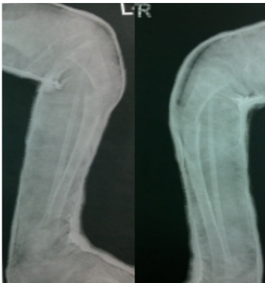
Figure 3. Bilateral osteotomy below the tibial tubercle.

result of primary conservative treatment was bilateral physeal injury in both distal femur and proximal tibia. Nonoperative treatment includes gradual stretching and serial casting, which is the most commonly recommended treatment in early infancy. Bensahel et al recommended surgery in children older than 3 months if nonoperative modalities failed (1).