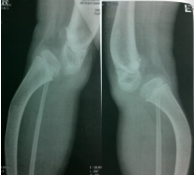
Figure 1. Bilateral congenital dislocation of the knee and anterior bowing of proximal tibia.