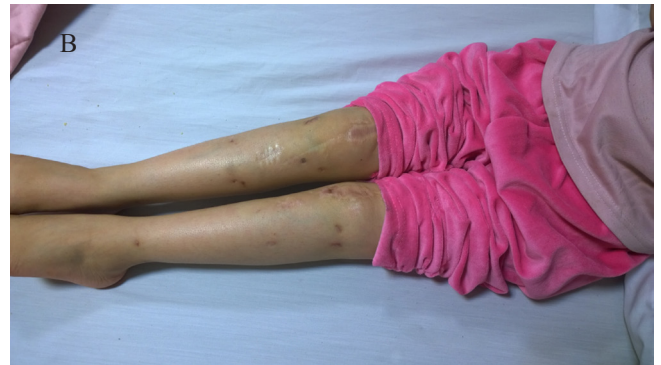
Figure 4. A: 90 deg flex B: full ext 2years after the final surgery.