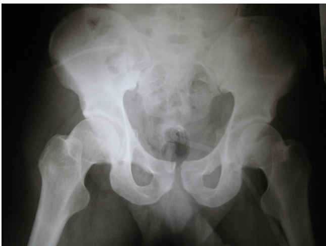
Figure 2. Post reduction radiograph.

Closed reduction of the overlapped pubic symphysis may be accomplished by using the femur as a lever arm in flexion, abduction and external rotation. This position tightens the iliofemoral ligament. Then, gentle rocking motion, rotation and abduction of the femur may reduce the overlapped dislocated pubic symphysis (1, 7, 13). This maneuver has a risk of femoral neck fracture. A