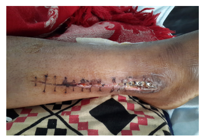
Figure 3. Exposed implant, seen in a patient of distal tibia & fibula fracture managed by dual plating.

The patients were operated on under spinal/epidural anesthesia. The pre-op antibiotics were given 30 minutes before surgery. The patient was placed supine on a radiolucent table. A bump was placed under the ipsilateral hip to internally rotate the affected limb and to provide easier access to the lateral side of the ankle. A pneumatic tourniquet was applied and inflated after the entire limb was prepared and draped. For fixation of the fibular fracture a small incision starting \sim 2 cm proximal and extending to the tip of the lateral malleolus was given, after careful dissection of the soft tissue, the tip of the lateral malleolus was exposed and using a 2.7 mm drill bit, a portal was made into the medullary cavity of the distal fragment of the fibula. A rush nail of appropriate size was put initially into the distal fragment only, by doing so we were able to control the distal segment and it was reduced to proximal fragment under C-arm control. Once the fracture was reduced the nail was advanced into the proximal fragment. The fracture was reduced in a closed manner under C-arm control in all the patients and we did not perform a mini open technique for reduction in any case. The size of the rush nail varied upon the medullary cavity and location of the fracture. In the next step, the distal tibial fracture was then approached through the anteromedial incision of 5 cm at the distal part by the MIPPO technique. The