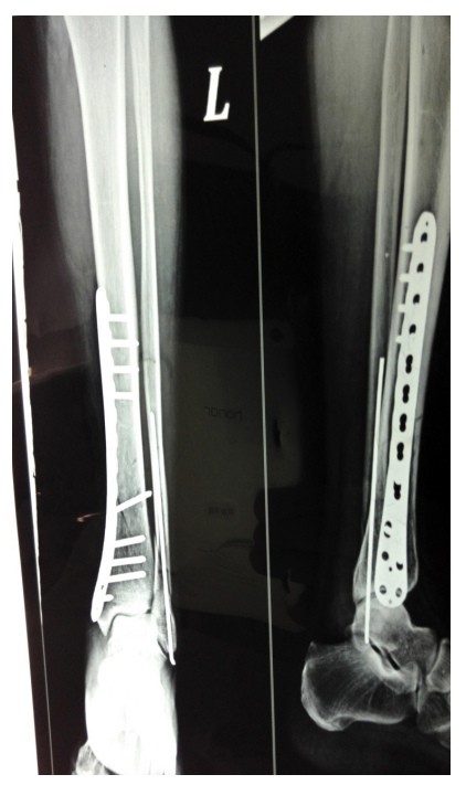
Figure 4. Radiograph showing stable fixation of fracture with a plate and rush nail.

All the 30 patients (mean age: 42.4; 18 males and 12 females) were available for regular follow up until 6 months. Demographics and data on laterality is given in Table 1 & 2. The most number of patients were in the age group of 35-50 years. The fractures were classified according to OTA classification, there were 14 patients belonging to type A (46.67%), 11 cases of type B