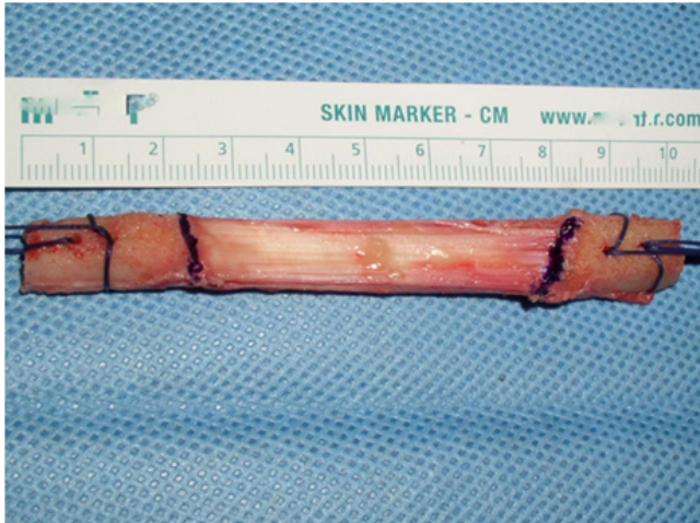
Figure 1. Patellar tendon length measurement.

femoral bone plug, drilling a longer tibial tunnel, graft rotation, tibial tunnel bone grafting, and the modified harvesting and single bone plug techniques (6, 10-13).