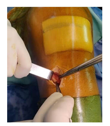
Figure 5. Dissection using Metzenbaum scissors and "bubble-sign"

Metzenbaum scissor slides proximally for 3 cm along the superior border of the bump. The dissection forceps now retract the inferior lip of the bump downwards. This is the sartorius fascia, on the deep side of which two tendons are visible: the gracilis is above and proximal to the semitendinosus and has a rounded-shaped muscular belly; the semitendinosus is deep and distal to the gracilis and has a U-shaped muscular belly. Sometimes, identification of the individual tendons can be difficult with the fascia getting in the way or due to the tendon-like appearance of the fascia [Figure 6]. The authors suggest to carefully evaluate the elasticity of these structures, with the more elastic ones representing the tendons, and the stiffer one representing the fascia. The opted tendon can now be grasped, with the help of a hook.