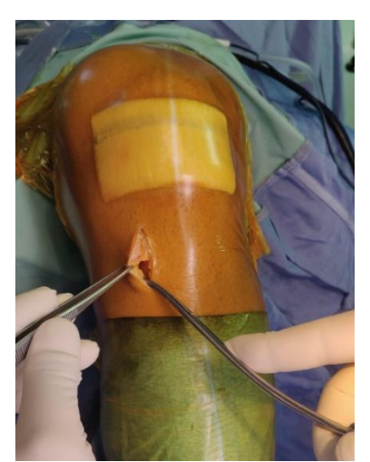
Figure 4. Skin incision and surgical approach to pes anserinus