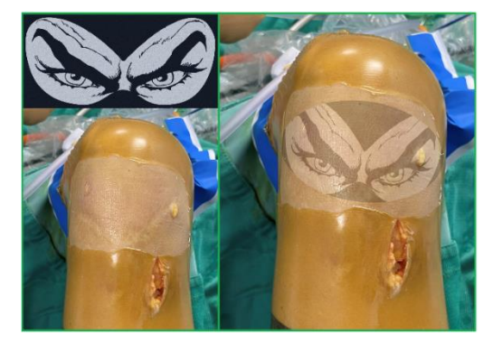
Figure 3. "Diabolik"-like appearance of the knee