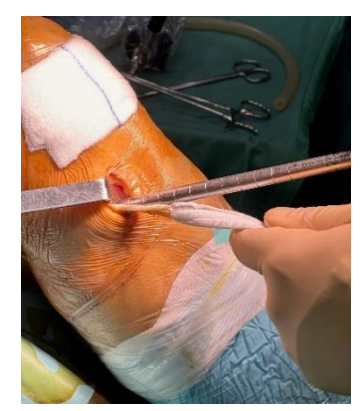
Figure 7. Stripping of gracilis tendon

Usually, the gracilis is harvested first. Current anatomic ACLR and fixation techniques use multiple-stranded HS autografts with an ideal tendon length greater than 21 cm.<sup>16</sup> The tendon can be pulled when the stripper is at the desired length to avoid damage to the muscle bellies of the HS tendons [Figure 7]. The stripper should not be used if it does not flow smoothly along the tendon: it may be halted by expansions and is responsible to cut the tendon rather than the expansion, resulting in a short graft. Maintaining distal insertion can be helpful to leave the tendons inserted distally on onto the tibia to eradicate muscle fragments using an open Mayo scissor, in a maneuver that resembles curling a ribbon for a birthday present [Figure 8].