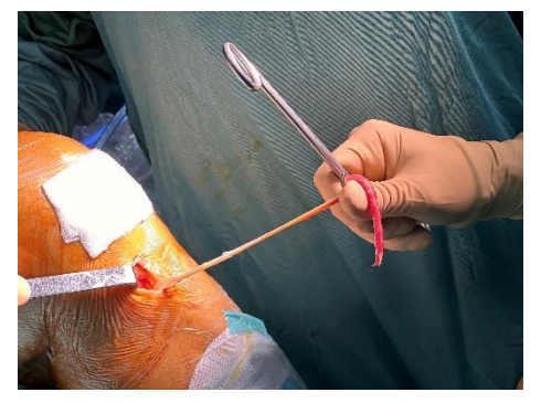
Figure 8. Cleaning muscles fragments out of tendon with a ribbonpresent maneuver