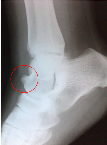
Figure 1. Dysplasia Epiphysealis Hemimelica on the anterolateral corner of talar neck presenting with pain and motion limitation in a 21-year-old woman.