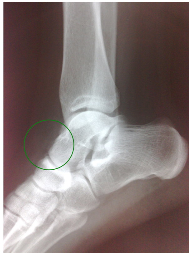
Figure 4. Post-operative radiography of the patients after excision of the lesion to the level of talonavicular joint