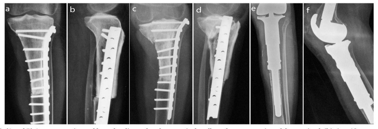
Figure 2. (A and B) Anteroposterior and lateral radiographs of osteoarticular allograft reconstruction of the proximal tibia in a 12-year-old boy; (C and D) Anteroposterior and lateral radiographs of the same patient after fracture of the osteoarticular allograft; (E and F) Anteroposterior and lateral radiographs after three years of implanting MUTARS cementless prosthesis

After the operation, the knee was protected with a knee immobilizer for two weeks for the distal femur and for four weeks for proximal tibia reconstruction. Active and passive range of motion (ROM) were started after removing the knee immobilizer. Isometric exercises and toe-touch weight-bearing were also allowed from the third day after the operation. The patients were asked to remain on toe-touch weight-bearing for six weeks and partial weight-bearing for up to 50% of the body weight for another six weeks after the operation. Follow-up visits were performed every three months for the first year, every six months for the second year, and yearly afterward.