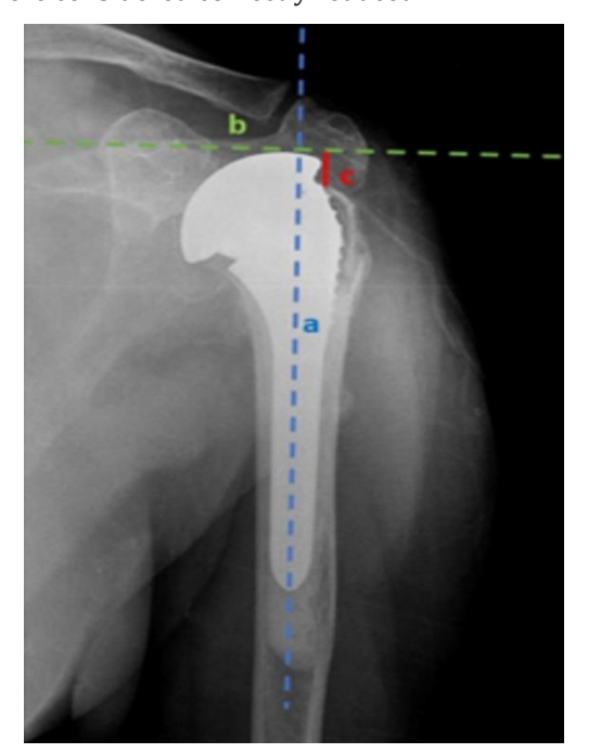
Figure 1. Head-Tuberosity Distance (HTD is obtained by measuring the height of the superior articular surface of the humerus relative to the superior margin of the greater tuberosity. (a): long axis of the implant, (b): line perpendicular to the long axis of the implant and tangent to the top of the prosthesis head, (c): Head-Tuberosity Distance

TUBEROSITY REDUCTION FOR SHOULDER HEMIARTHROPLASTY