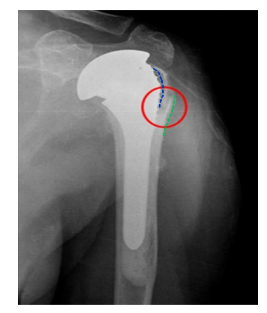
Figure 2. Contact (red circle) between the humeral diaphysis (green line) and reconstructed greater tuberosity (blue line)

TUBEROSITY REDUCTION FOR SHOULDER HEMIARTHROPLASTY