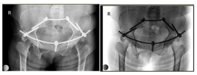
Figure 3. Follow-up x-ray one year after surgery

After a 7-day observation period, she was discharged and followed on a biweekly basis for three months with physiotherapy and occupational therapy. In the third month, the patient was pain-free and able to walk with a walker and ankle-foot orthosis [video 1] . The X-ray one year after the surgery shows excellent union [Figure 3] .