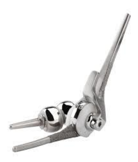
Figure 5. Latitude total elbow arthroplasty (Tornier Surgical Implants, Stafford, TX 77477, USA)