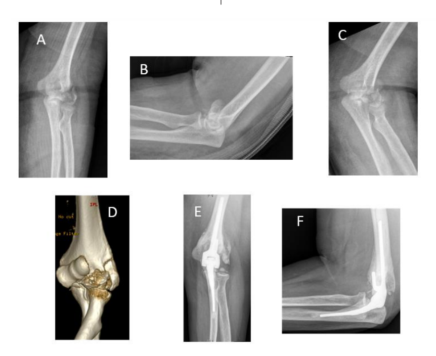
Figure 4. 72-year-old female with a comminuted, displaced, distal humerus fracture. Due to the fracture pattern, reconstruction was deemed impossible during surgery, and therefore patient underwent total elbow arthroplasty (TEA): (A-D) preoperative views; (E-F) postoperative radiographs