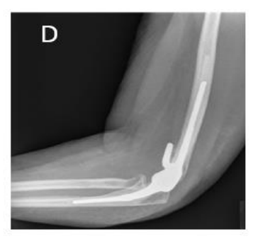
Figure 2. 69-year-old female with a comminuted, displaced, distal humerus fracture. Due to the fracture pattern, reconstruction was deemed impossible during surgery, and therefore patient underwent total elbow arthroplasty (TEA): (A-B) preoperative views; (c-d) postoperative radiographs