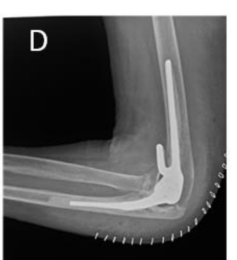
Figure 3. 75-year-old female with a long history of elbow pain in a setting of rheumatoid arthritis, not responding to conservative measures. The patient underwent uncomplicated total elbow arthroplasty (TEA): (A-B) preoperative radiographs; (C-D) postoperative views