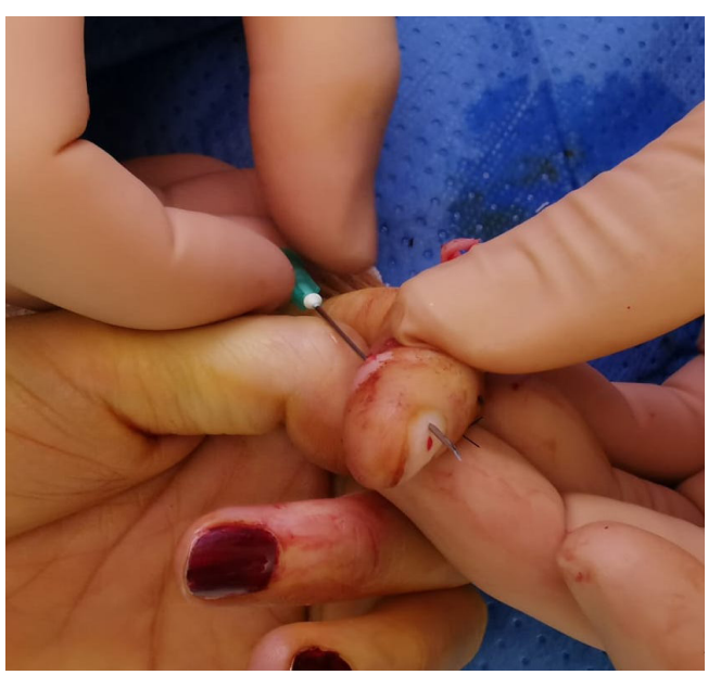
Figure 1. Needle is passed through tendon remnants along the side of the distal phalanx and exits through the nail plate, not engaging the nail folds.

tip of the tendon, and the needle of the nylon suture is then cut. The same trajectory sequence of a 21-gauge hypodermic needle is used at the other side of the distal phalanx, and the other end of the nylon suture thread is passed through the needle from volar to dorsal, providing a second fixing point [Figure 4].