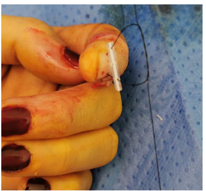
Figure 5. Passing the Nylon sutures into the plastic tube at two different holes and double non-locking knot of Nylon suture.

holes to form a gutter. Here, a non-locking double knot is made and gently tightened or released in the gutter until obtaining the optimal tendon tension [Figure 5]. The goal is to obtain a physiological digital flexion cascade when the wrist is in extension and a complete extension of the injured finger when the wrist is in flexion [Figure 6]. Once good tension is obtained, several locking knots are made, and the stability of the fixation is checked.