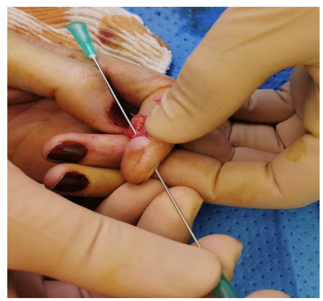
Figure 2. The second needle is pushed on the tip of the first needle and replaces the first needle.

As a result, each nylon suture thread is attached to the