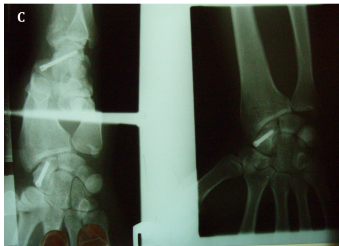
Figure 2. A. Trans-scaphoid perilunate fracture-dislocation in a 37-year old man due to falling.

B. Anteroposterior and lateral wrist radiography after non successful closed reduction and casting.