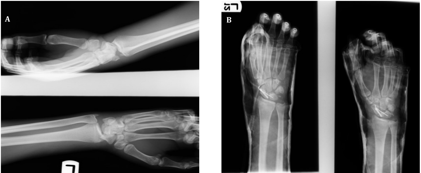
Figure 1. preoperative(A) and post operative(B) radiography of a 21-year old man with trans-scaphoid perilunate fracture dislocation of the left wrist.

and they willingly took part in the study. Twenty patients were treated with early open reduction and internal fixation by two senior orthopedic surgeons (FB and HRS) and 14 were treated non-operatively by closed reduction and long arm cast in emergency room. Patients' charts were reviewed and pre and post operation radiographies were studied. Patients were examined to determine the wrist range of motion and grip strength. To evaluate the extent of joint degenerative changes, AP and lateral radiographs were obtained of all the patients.