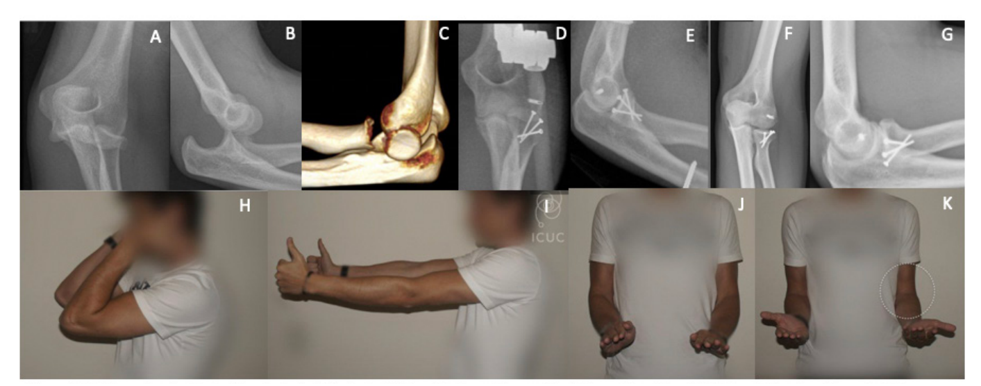
Figure 1. Radial head fracture with a posteriorly dislocated fragment without evidence of elbow dislocation on injury films (A-C) Injury films show the posteriorly dislocated radial head fracture fragment and likely subluxated ulnohumeral joint, better visualized on the 3-dimensional CT scan. (D-F) Postoperative radiographs after primary fixation of the radial head and repair of the LCL complex, showing a healed radial head and concentric ulnohumeral at final follow-up without evidence of avascular necrosis or instability.

*Functional limitation and pain scores are rated on a scale from 0 to 4, with zero as no pain or functional limitation and 4 as unable to do any activity/ maximum pain