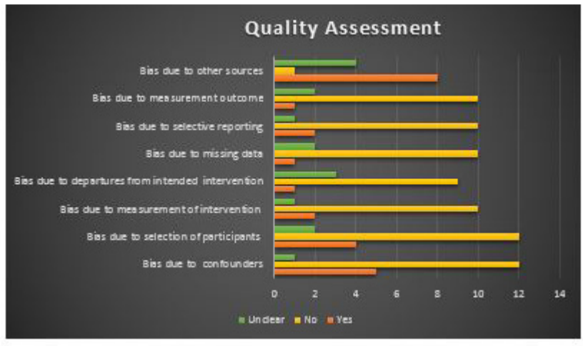
Figure 2. Quality assessment of the studies included in the review.

HIP ARTHROSCOPY IN THE TREATMENT OF AVASCULAR NECROSIS OF THE HIP