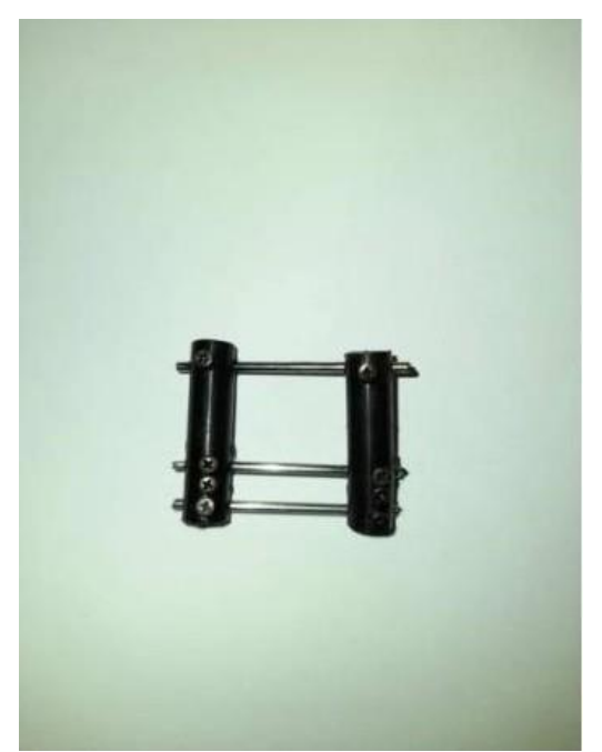
Figure 1. The dynamic mini fixator.

Mini rod is a cylinder with outer and inner diameters of 5 mm and one 1.6 mm transfer hole in the proximal end and three 1.6 mm holes in distal, respectively, and is designed to take in the K-wires. K wires were affixed by 1.4 mm self-tapping steel screws to the rod via 1-mm holes, perpendicular to 1.6 mm holes of the rod. Subsequently, mini-screws firmly attached the K-wires into the mini rods. Two mini rods were used in both the radial and ulnar sides of the finger.