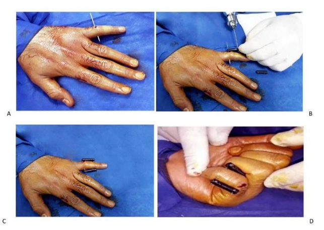
Figure 5. A: The first pin was inserted in the center of the proximal phalanx head and cut with adequate length at both radial and ulnar sides of the finger. B: After assembling the ulnar-side mini rod, the second pin advanced through the distal hole of the mini rod to the shaft of the middle phalanx and exited from the contralateral skin of the finger. C: The second- radial side mini rod was assembled, and with the application of sufficient traction, pins were affixed to the mini rods by mini-screws. D: Flexed affected finger after the application of P-frame.