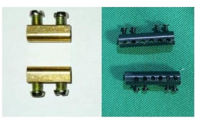
Figure 2. Former and new designs of mini rods and screws.

TREATMENT OF FRACTURE-DISLOCATIONS OF PROXIMAL INTERPHALANGEAL JOINT BY DYNAMIC MINI EXTERNAL FIXATOR