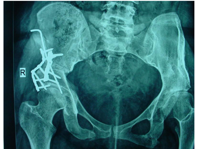
Figure 1a, b. a pre- and b post operative radiography of the modified triple osteotomy.