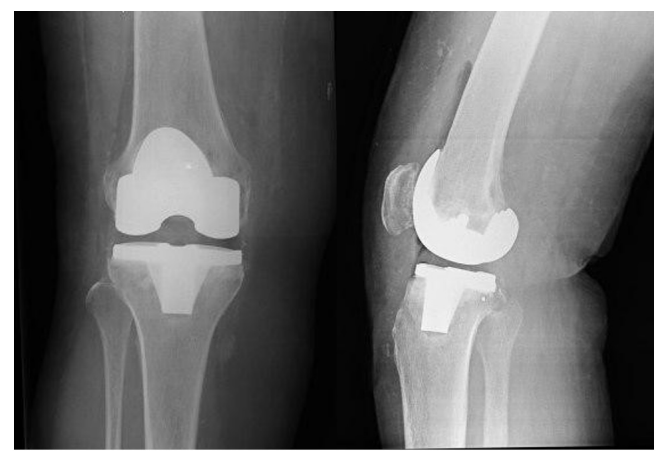
Figure 2. Primary prosthesis implementation during the second stage.

TWO-STAGE ARTHROPLASTY OF DEGENERATIVE SEPTIC KNEE