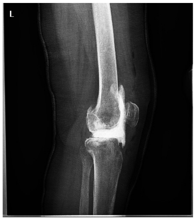
Figure 1. Static cement spacer after performing of anterior and distal femoral cut and proximal tibial cut.

The patient was ambulated with the aid of a walker to bear weight as tolerated.