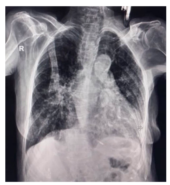
Figure 3b. Initial Chest x-ray at ED.

The patient was a 93 year old female admitted with femoral neck fracture [Figure 3a]. Initial examination showed a low grade fever along with cough and feeling of fatigue. Primary laboratory study revealed leukocytosis (1.1 \times 10^9 \text{ cells/L}) with 8% lymphocyte count (significant lymphopenia). A second CBC after 2 days showed 5.5 \times 10^9 white blood cell/L consisting of 13% lymphocyte. In addition, CRP and LDH were 55 and 472, respectively while other laboratory studies were in a normal range. Initial chest X-ray was highly suggestive [Figure 3b] and the subsequent chest CT scan was diagnostic for COVID-19 [Figure 3c] and RT-PCR was positive. We were urged to postpone surgery due to severe pulmonary