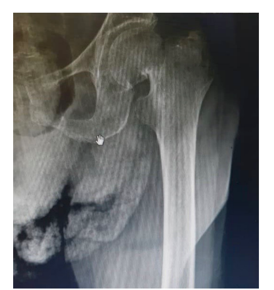
Figure 3a. Left displaced Femoral neck fracture.

The patient was a 69 year old male admitted with intertrochanteric femoral fracture [Figure 2a]. Following our experience with patient 1, we carefully evaluated the patient. He had no fever and no cough but he was complaining of weakness. The chest CT scan was diagnostic [Figure 2b]. In addition, CRP was (2+) and lymphocytopenia (0.6 \times 10^9 \text{ cells/L}) was present while