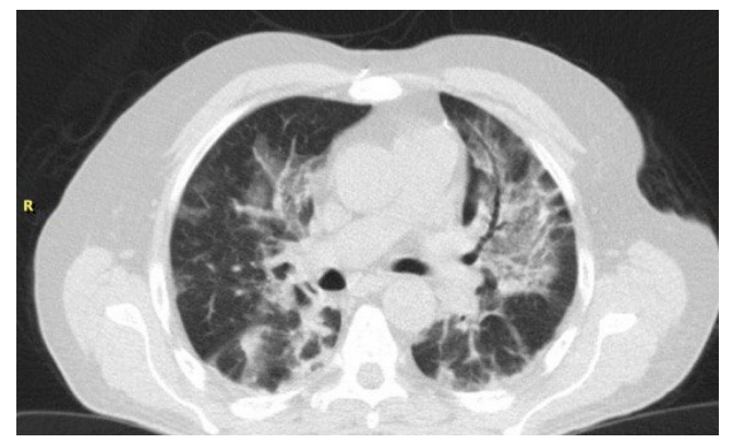
Figure 2b. Initial chest CT scan which was diagnostic for COVID-19 infection.

other laboratory studies were in a normal range. The patients were treated in a same manner as was done for patient 1.