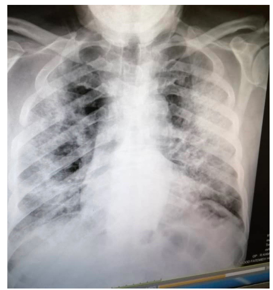
Figure 1b. 3 days post operative chest X-ray.

oxygen saturation dropped to 90% during surgery which raised to 96% with face mask and O_2 supplement. He was transferred to post anesthesia care unit (PACU) and was discharged from the hospital after 2 days. He returned to the hospital 3 days after discharge with new onset fever, weakness, dyspnea, and anorexia. Initial evaluation ruled out surgical site infection while the chest X-ray was suggestive of COVID-19 leading to readmission of the patient [Figure 1b]. Laboratory results showed positive CRP and elevated liver function tests including AST, ALT, and LDH. Complete blood count (CBC) demonstrated 7.7 \times 10^9 white blood cells/L with 81% neutrophils and 13% lymphocytes illustrating significant lymphocytopenia. Moreoevr, chest HRCT was diagnostic [Figure 1c] although the RT-PCR was negative. Due to the predictive value of the findings, PCR was considered false