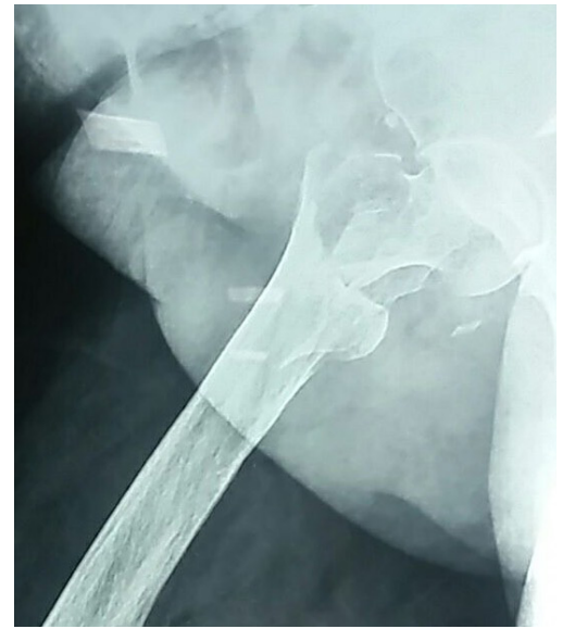
Figure 1a. Intertrochanteric hip fracture.

The patient was 73 year old male admitted with intertrochanteric femoral fracture [Figure 1a]. Routine preoperative laboratory exam did not show any abnormality. However, he was complaining of a recent generalized weakness. He underwent surgical fixation under spinal anesthesia and intravenous sedation. His