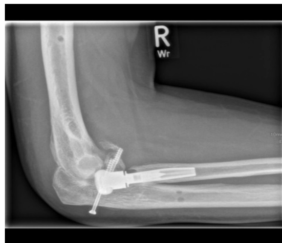
Figure 2. Secondary subluxation of primary inserted radial head resection arthroplasty.

Severity of posttraumatic osteoarthritis according to the Kellgren-Lawrence grading scale was significantly lower in groups 1 and 3 compared with group 2 ( P=0.02 ) [Figure 4] (24). Comparing subgroups, the group of radial head fracture related to elbow dislocation demonstrated a trend of worse functional outcome