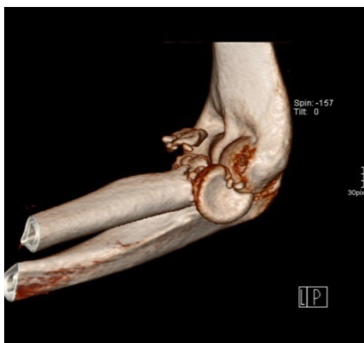
Figure 5. 3-D computed-tomography scan demonstrating a Mason type IV fracture with elbow dislocation and fracture of the coronoid process in a 42-year-old male patient leading to functional instability.

compared to the group of isolated radial head fracture, but without significance [Figure 4]. In the subgroup of patients with Mason IV fracture [Figure 5], the outcomes of group 1 and group 3 were superior to group 2 in terms of secondary osteoarthritis ( P=0.006 ), pain ( P=0.04 ), and functional outcome ( P=0.012 ) [Figure 4].