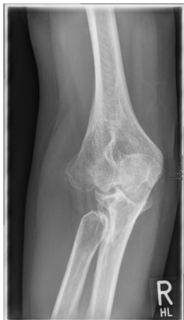
Figure 1. Situation after necessary secondary removal of a primary inserted radial head resection arthroplasty in a 32-year-old female patient.

3 patients, signs of superficial infection in 1 patient, and loosening of material in 1 patient [Figure 2].