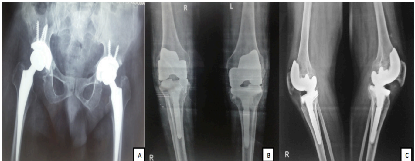
Figure 3. Four years follow up X-ray showing (A) Anteroposterior view of the pelvis with both hips (B) Anteroposterior view of both the knees (C) Lateral view of both the knees.

also operated simultaneously to correct the non-arthritic knee contracture associated with Ankylosing Spondylitis (18). Knee contracture was released by modified posterior soft tissue release (19). So, the concept and need for four joint surgeries was much felt by us for these difficult patients if they present with arthritic knees in addition to hips. The current case was a step ahead of this where the arthritic knees were also replaced simultaneously. Yoshino and Jegersen et al in their independent series of 18 & 16 patients respectively with Rheumatoid Arthritis who underwent replacement of both hips and knees in stages concluded that bilateral replacement of hip and knees can achieve the objectives of relieving pain