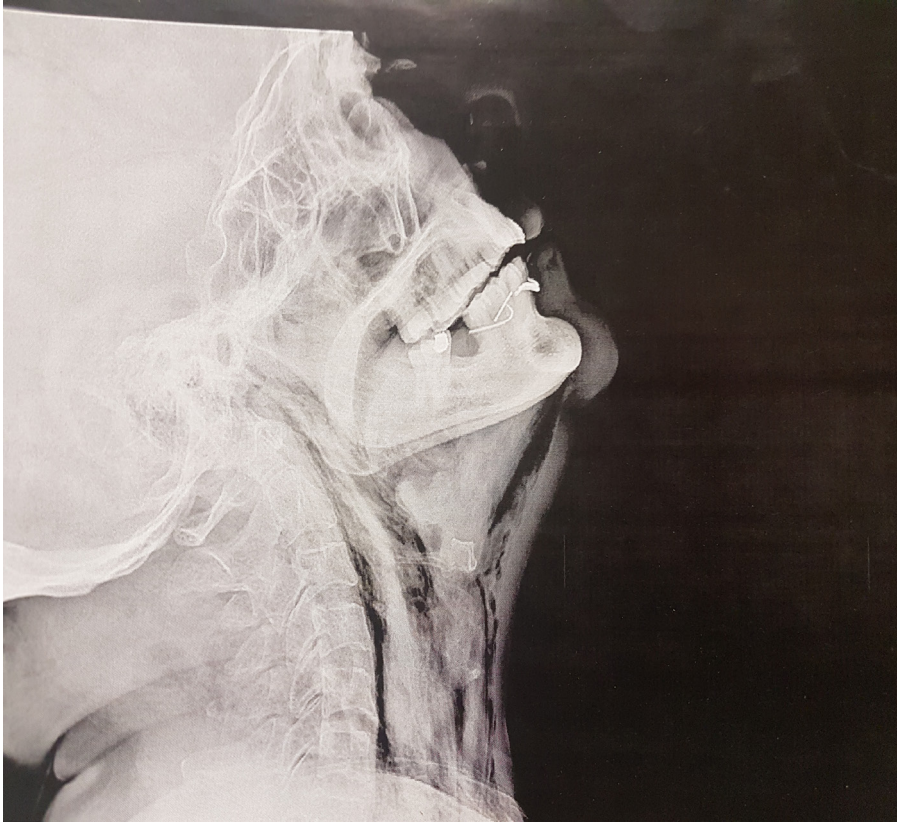
Figure 1. Significant subcutaneous facial and cervical emphysema.