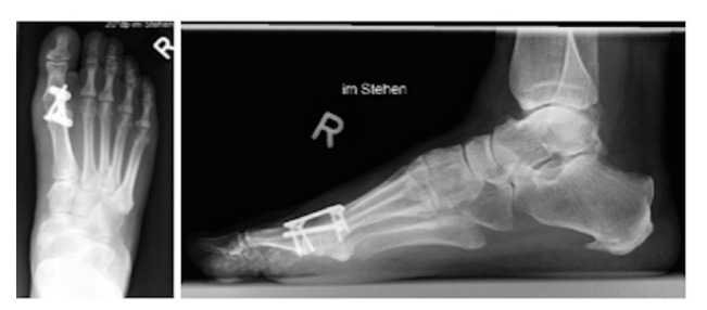
c) Locking plate