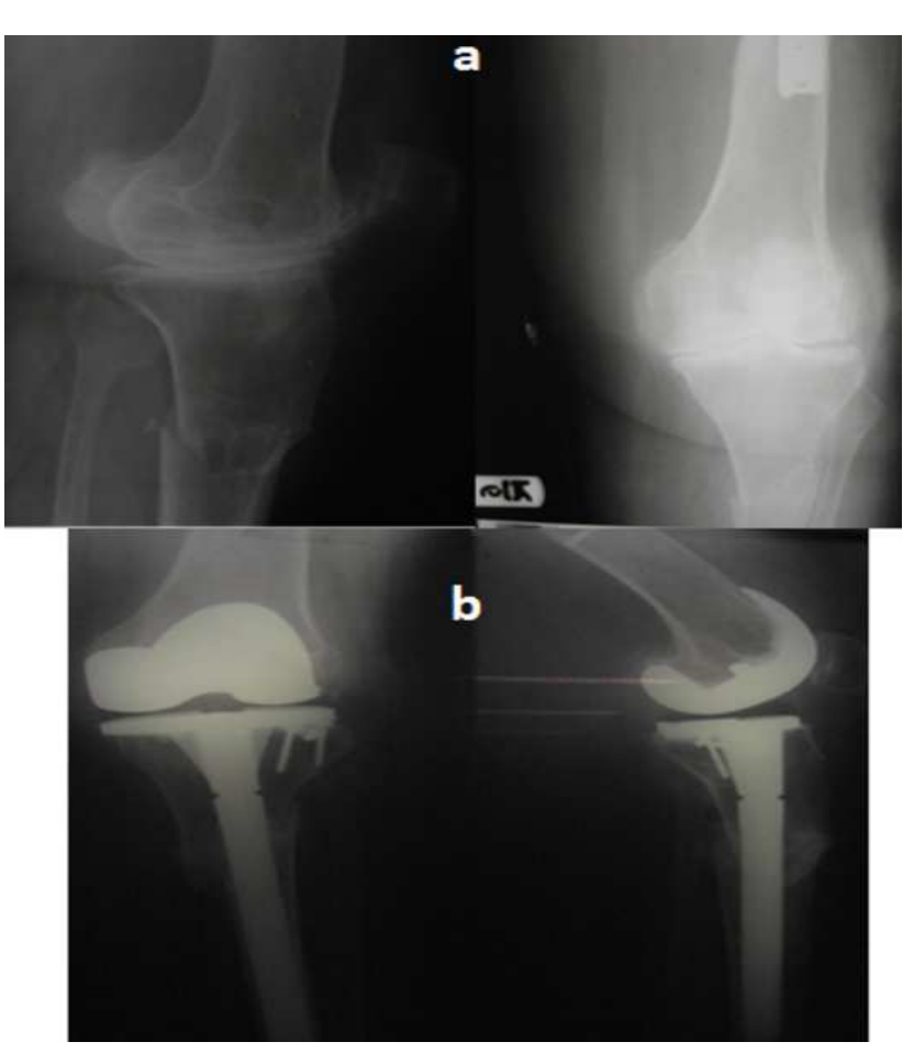
Figure 2. A 67 years old male suffered from proximal tibial fracture AO type A treated with TKA. a) Preoperative anteroposterior and lateral x-rays and b) Anteroposterior and lateral x-rays taken 4 years Postoperatively.

THE ARCHIVES OF BONE AND JOINT SURGERY. ABJS.MUMS.AC.IR Volume 5. Number 5. September 2017