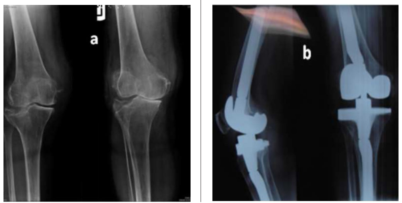
Figure 1. A 64 years old female with proximal tibial fracture AO type B associated with MCL avulsion. a) preoperative x-rays and b) X-rays 3.5 years after TKA.

Statistical analysis was performed using SPSS version 16.0 (Chicago, Illinois). Wilcoxon test was used to compare the pre- and post-operative Tegner activity scale. Also, the range of knee flexion was compared between injured and uninjured limbs using independent samples t-test. P-value <0.05 was considered significant.