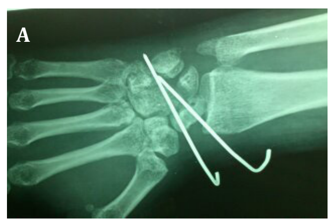
Figure 4A-B. Postoperative anteroposterior (A) and lateral (B) radiographs showing K-wire fixation and ligament repair.