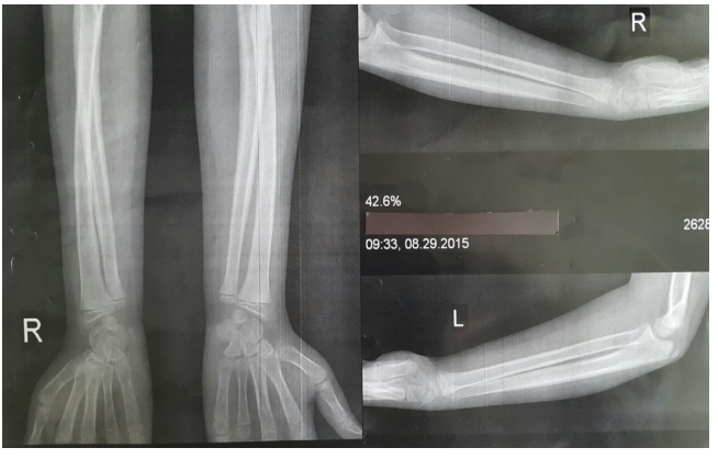
Figure 1. Plain radiography showed multifocal areas of mixed lytic and sclerotic lesions in carpal bones accompanied by a fine periosteal reaction along radius and ulna.

He was discharged with Naproxen 500mg/q12h and was advised to come back every three months for Pamidronate therapy. After two courses of Pamidronate, the child went to remission with no fever and pain while the acute phase reactants returned to normal levels. The patient gained weight and returned to normal daily activities.