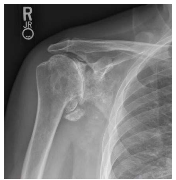
Figure 1. Right shoulder radiograph demonstrating severe glenohumeral degenerative changes with multiple radiodense loose bodies.

Plain radiographs revealed severe degenerative changes to the glenohumeral joint including subchondral sclerosis as well as multiple radiodense loose bodies [Figure 1]. Magnetic resonance imaging (MRI) confirmed the radiographic findings and also demonstrated high grade rotator cuff tedinopathy with atrophy and fatty infiltration to the rotator cuff musculature. The decision was made to proceed with a reverse total shoulder arthroplasty given the severe