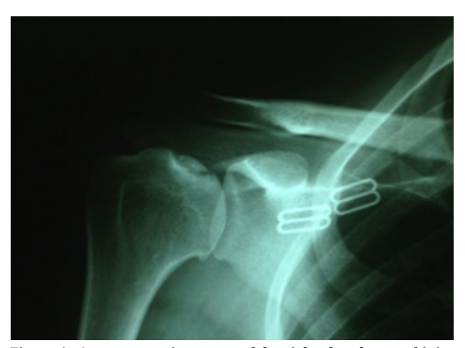
Figure 1. Anteroposterior x-rays of the right glenohumeral joint showing an oval radiolucent area measuring about 1 cm on the superior aspect of the humeral head surrounded by a sclerotic irregular border of the humeral head.

Patient was a 37 years old housewife, right handed, who admitted to emergency department (Shafa Orthopedic Hospital) because of pain in her right shoulder following a recent minor trauma. Routine radiography was performed. An oval radiolucent area in the humeral head was found incidentally [Figure 1]. The shoulder was immobilized for one week using an arm sling and the patient was referred to the shoulder clinic. We visited the patient three weeks after initial trauma. She had no history of shoulder pain or motion limitations and did not remember any previous major