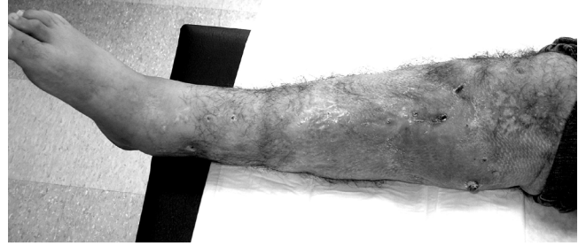
Figure 5. Clinical image showing the final result with closure of the proximal wound.

EPITHELIALIZATION OVER ANTIBIOTIC-IMPREGNATED PMMA BEADS