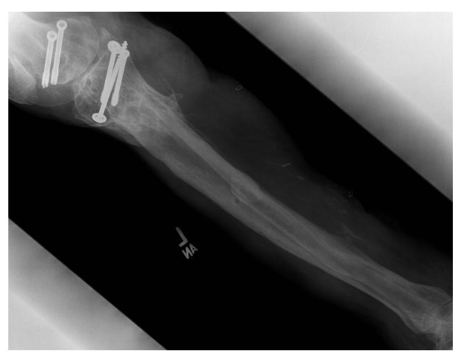
Figure 3. A plain radiograph showing bone healing after substituting the pellets with bone graft.

A 60-year-old male patient sustained a shrapnel injury to his right leg and foot (Gustilo-Anderson Type IIIC). He was managed acutely with vascular repair, skeletal traction, and extensive debridement. After debridement