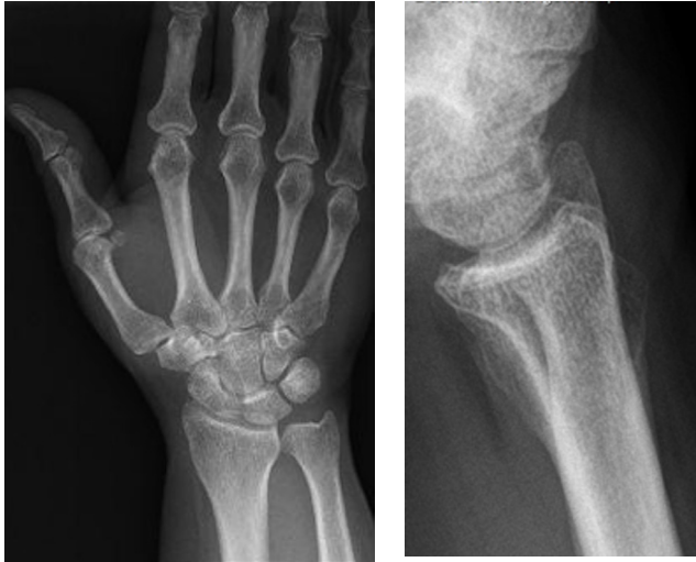
Figure 1. Anteroposterior and lateral views of wrist x-rays.

an uneventful postoperative outcome and had no symptoms of recurrence thirteen months after the surgical procedure.