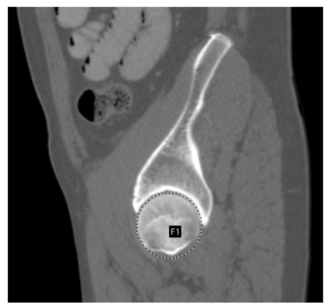
Figure 2. Femoral head center placement (F1) has been shown.

midline of the sacrum, a perpendicular bisector of the S1 superior endplate was drawn. The PI was determined by measuring the angle between the perpendicular bisector of the S1 endplate and the midpoint of the line joining the centers of the femoral heads (F1 and F2) [Figure 1; 2].