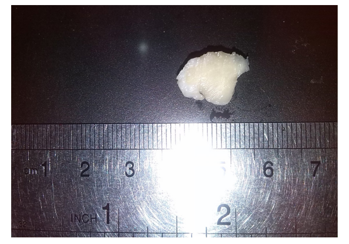
Figure 3. Gross Pathologic Specimen.

AN ISOLATED MASS IN THE PALM, STARTING MANIFESTATION OF SARCOIDOSIS