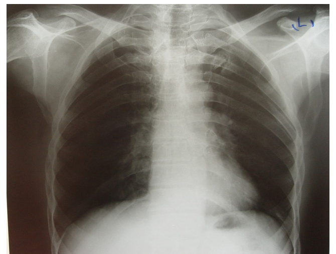
Figure 6. Chest X-ray PA.No lesion or pulmonary Hillary lymph Node is seen.

AN ISOLATED MASS IN THE PALM, STARTING MANIFESTATION OF SARCOIDOSIS