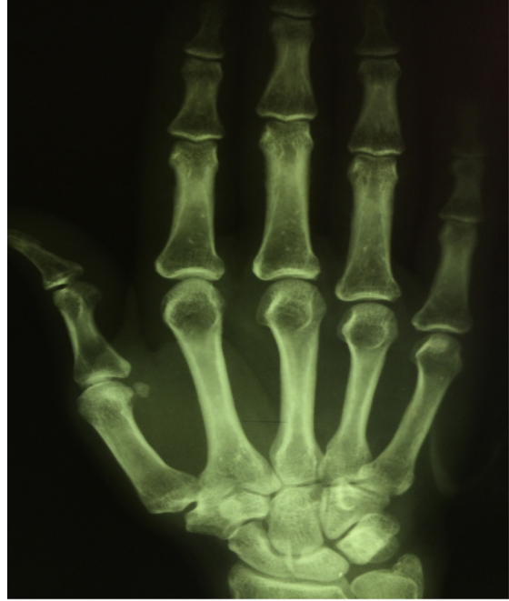
Figure 1. Hand X-ray. No Sing of mass of bone destruction.

Musculoskeletal involvement is reported in 1-30% of patients (1-2). Lesions in hand has been reported in 0.2 % of patients and is rarely the first symptom (1-3,5,6). Most of the time disease is spread in small bones of carp