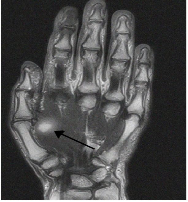
Figure 2. Hand MRI, T_1 , sagittal cut. Black arrow shows a mass in the bulk of muscle.

Sarcoidosis involving limbs is a rare entity and because of that Sarcoidosis is not considered, most of the time, in differential diagnosis of masses in upper and lower limb (3,4,8-10). Also when there is a soft tissue mass in the