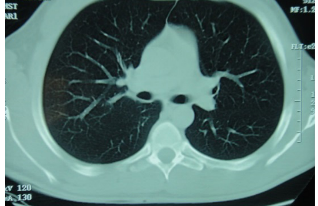
Figure 7. Chest CT Scan, Axial cut. No lesion or pulmonary Hillary lymph Node is seen.

limb, it is accompanied by prominent pulmonary hilar lymph nodes (10). To the authors' knowledge this is the first case of Sarcoidosis that presents only with a soft tissue mass in hand and has no other spreading in bones or pulmonary hilar lymph nodes.