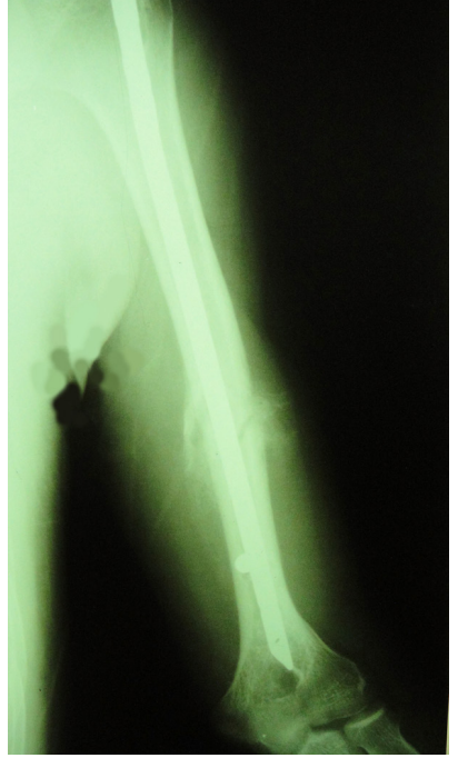
Figure 1. Decreased shoulder range of

Demographic characteristics (age and gender) and the above mentioned criteria were recorded and were statistically analyzed using the SPSS software package for Windows version 19 (SPSS Inc., Chicago, IL, USA).