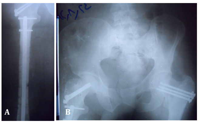
Figure 4. a (right) Postoperative radiography of the right femur after plate removal and replacing it with retrograde nail. b (left) both neck fractures healed during follow-up period.

the usual neck fractures. Thus, nonunion is rare in this situation (17).