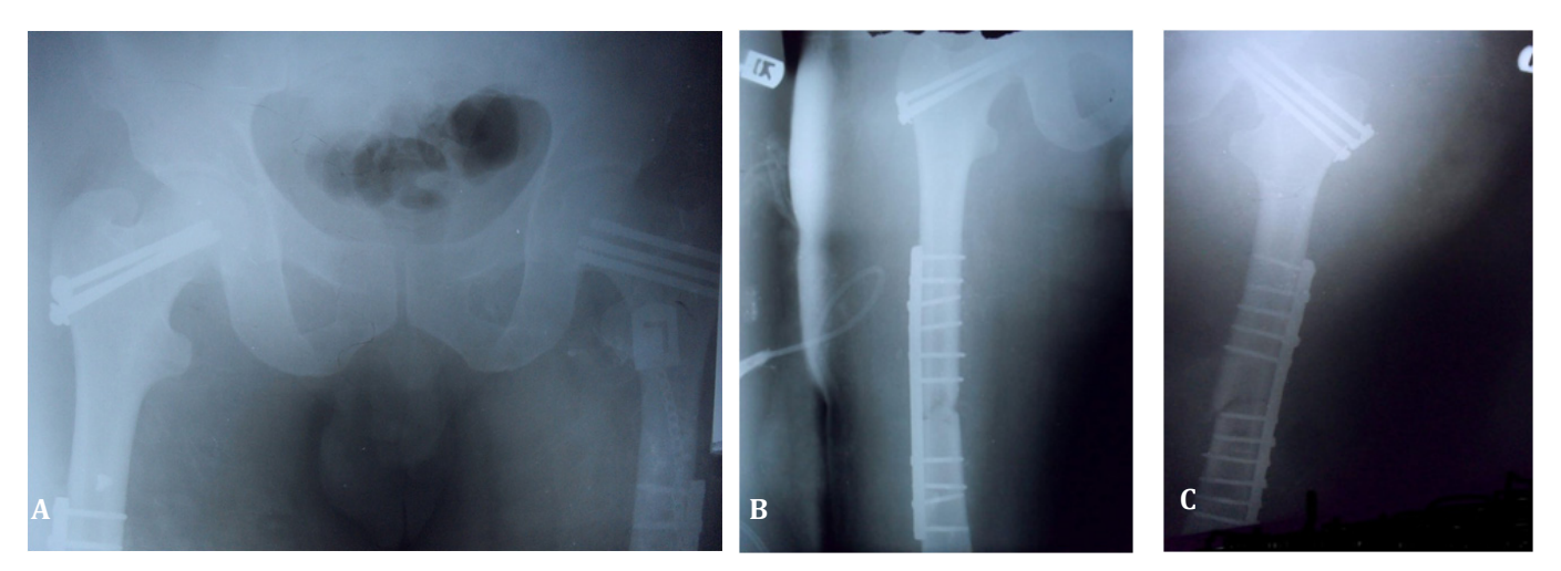
Figure 2. a ( right ) Postoperative radiography of patient demonstrates fixation of both femoral neck fractures using cannulated screws. b , c ( left ) postoperative radiographies show both femoral shaft fracture fixation using plate and screws.

These injuries are almost always resulted from highenergy trauma and usually are accompanied with several associated fractures. The suggested mechanism resulting to ipsilateral femoral shaft and neck fractures is compression of the femoral head against the acetabular roof while hip is in either abduction or adduction (9). Considering this, the mechanism of injury in our patient may have been a direct trauma because simultaneous indirect force on both hips and femurs seems unlikely although not impossible.