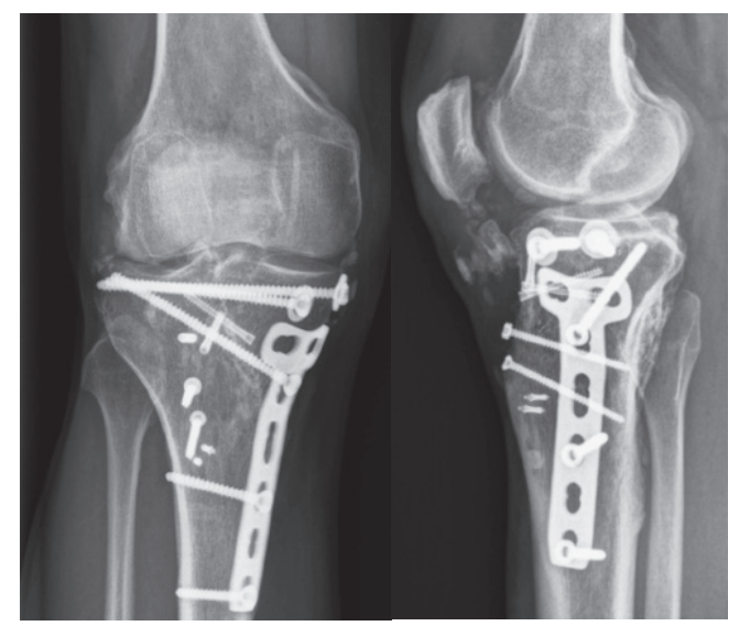
Figure 6. Anteroposterior (a) and lateral (b) radiographs taken at 2 year and 8 months after operative removal of heterotopic ossification, showing slight recurrence of the ossifications.

Heterotopic ossification around the elbow after fractures and surgery is common, with reported incidence ranging between 3% after simple elbow dislocations, 15-20% when the elbow dislocation was combined with fracture (9), to 89% in patients with a closed head injury and elbow trauma (10). From our own database we know that heterotopic ossification after surgery for tibia plateau fractures is very unusual. Our department