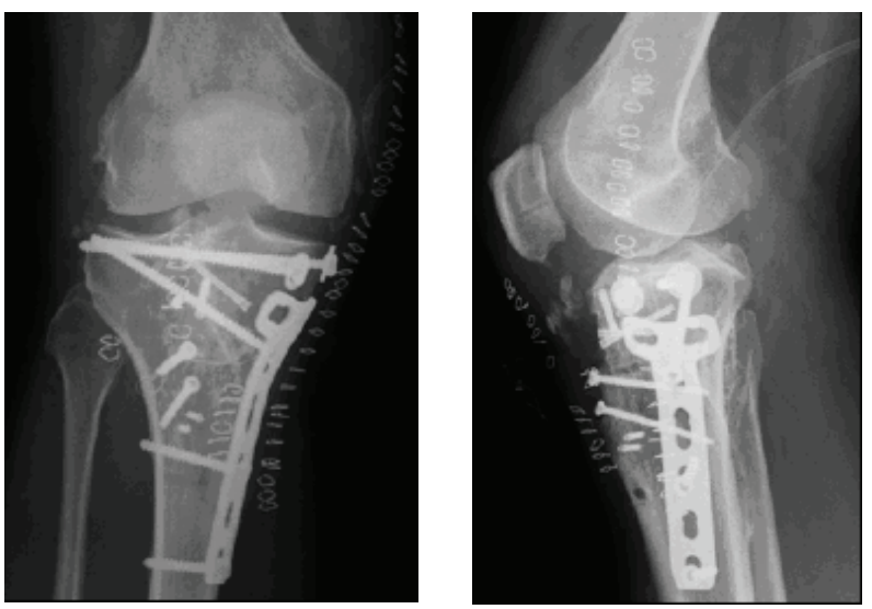
Figure 4. Anteroposterior (a) and lateral (b) radiographs taken directly after operative removal of heterotopic ossification showing near total removal of the ossifications.

HO AROUND THE KNEE AFTER INTERNAL FIXATION OF A COMPLEX TIBIAL PLATEAU FRACTURE