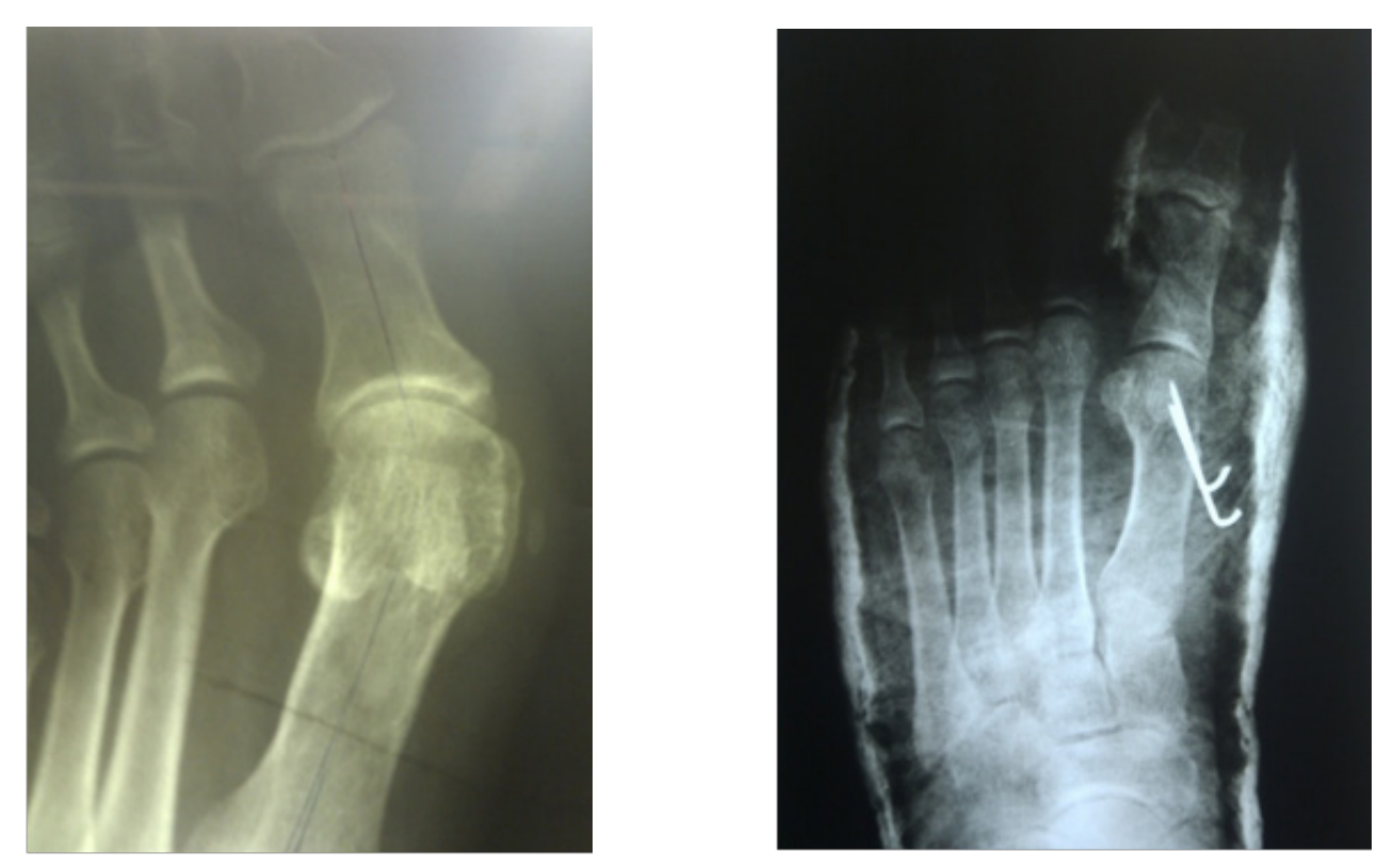
Figure 4. Pre-op (a) and post-op (b) x-ray of a 32 year-old woman with hallux valgus after Chevron osteotomy.

THE ARCHIVES OF BONE AND JOINT SURGERY. ABJS.MUMS.AC.IR Volume 2. Number 1. March 2014