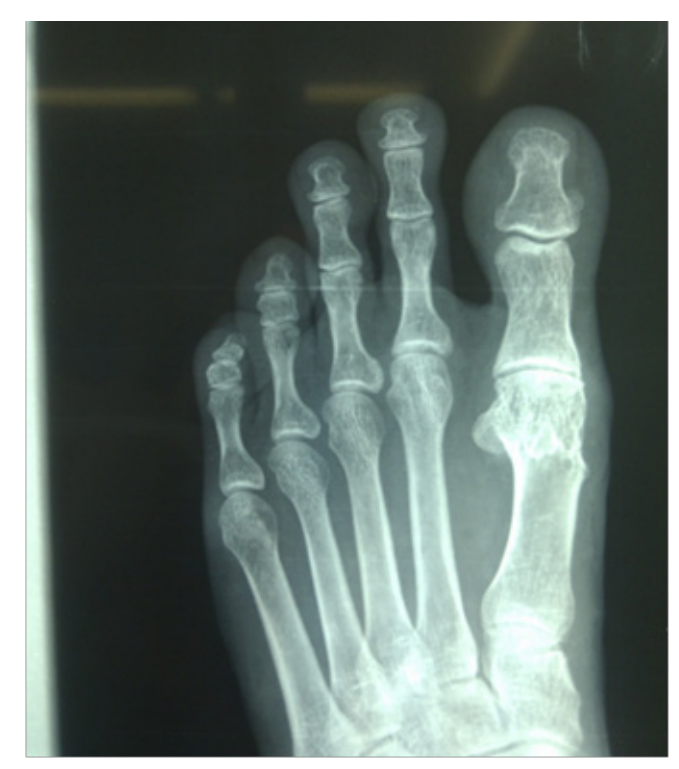
Figure 5. Pre-op (a) and post-op (b) x-ray of a 29 year-old woman after McBride procedure.

Comparing the two techniques for FADI average score and pain, higher results were achieved with the chevron osteotomy. Although this superiority was not statistically significant in the FADI score, angle correction was statistically significant. This osteotomy alone can correct the HVA for an average of 11-18 degrees and correct IMA for an average of 4-degrees (14).