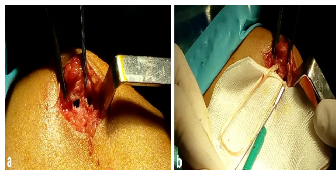
Figure 2. Intraoperative images. a) two 4.5 mm diameter holes are drilled at the proximal one-third of the medial margin of the patella; b) double-strand, plantaris tendon autograft ends are fixed inside the holes with 4.75 mm resorbable knotless anchors (SwiveLock®, Arthrex, Naples, FL, USA)

The anatomic femoral insertion point of the MPFL was identified through a skin incision between the medial femoral epicondyle and the adductor tubercle, according to